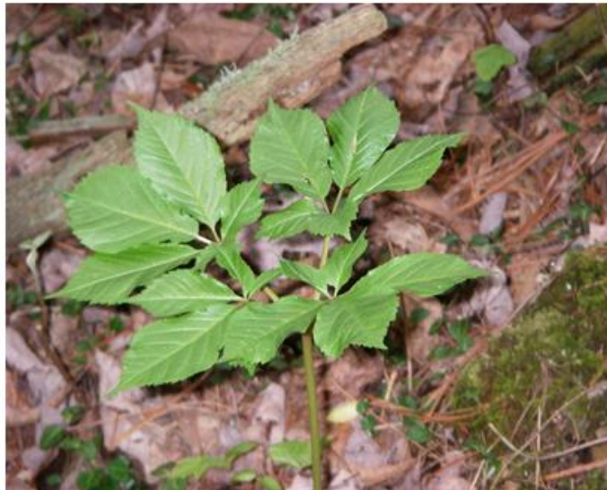
Four leaf adult