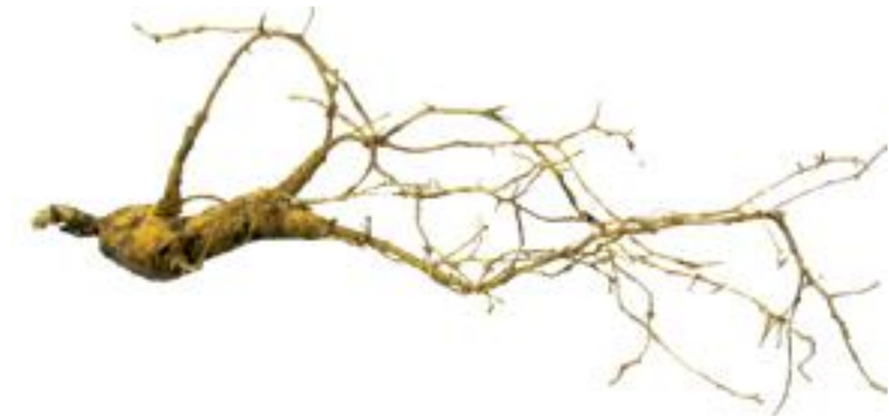
Picture 3: Wild Ginseng Root