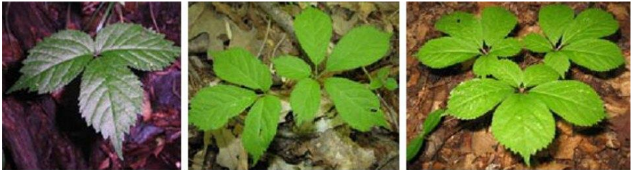
American ginseng seedling (left), juvenile (middle) and adult (right)

Ginseng plants, like humans, go through different developmental stages. Ginseng begins life as a seed, remaining in the soil 18 months prior to germination. A recently germinated ginseng has 1 leaf with 3 leaflets. These fragile plants are more susceptible to the 'elements' than they are at any other life stage; a drought or a disease outbreak may kill off all but the strongest juvenile plants. Ginseng may remain a 1 leaflet plant for several years as it accumulates enough energy to grow into a 2 leaflets, adolescent ginseng. Two leaflet ginseng may develop flowers and seeds, but reproduction is intermittent and low. Ginseng remains in this 2 leaflet stage for another 3-5 years before developing into a large adult plant (typically with 3 leaflets), which may in old age eventually have 4, or rarely 5 leaflets. These adult plants are hardy, and contribute the majority of seeds produced in a population of ginseng. It is these large adult plants that are removed from the population during a harvest event.